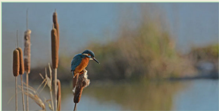
Kingfisher at Rodden Nature Reserve