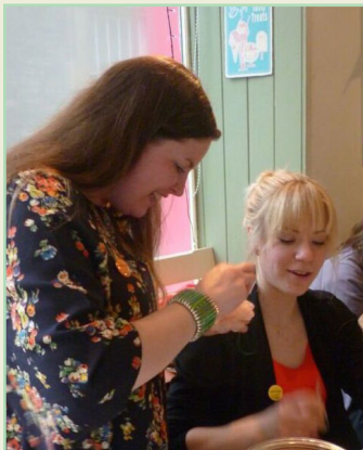
Workshop at Millie Moon