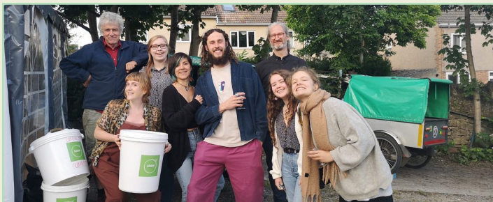
The Loop:Frome team

Children are welcome but must be accompanied by a parent or carer. Sorry, no dogs please. Booking advised as spaces are limited.