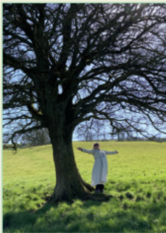
OpenStoryTellers' Peter the Wild Boy